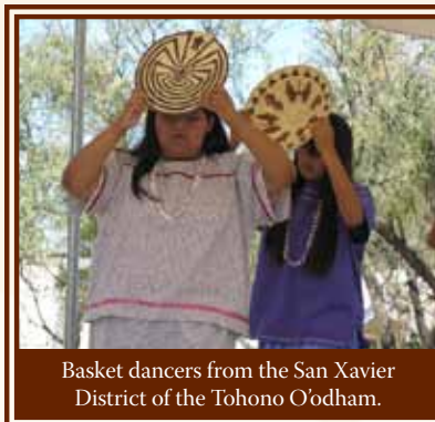
Basket dancers from the San Xavier District of the Tohono O'odham.