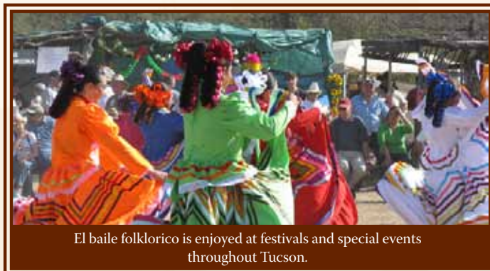
El baile folklórico is enjoyed at festivals and special events throughout Tucson.

Colossal Cave Mountain Park 16721 E. Old Spanish Trail Vail, AZ 85641 (520) 647-7275 www.colossalcave.com Description: Harvest saguaro fruit and learn about Tohono O'odham heritage. Admission: $5 vehicle entry