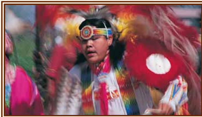
Gill Kenny © Metropolitan Tucson Convention & Visitors Bureau.