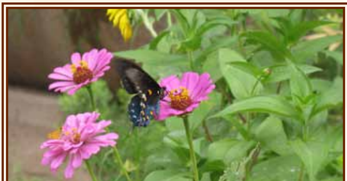
Several parks throughout Tucson have special events featuring a diversity of butterflies.