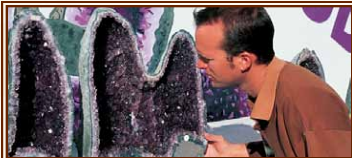
The world-renowned Tucson Gem, Mineral, and Fossil Showcase.