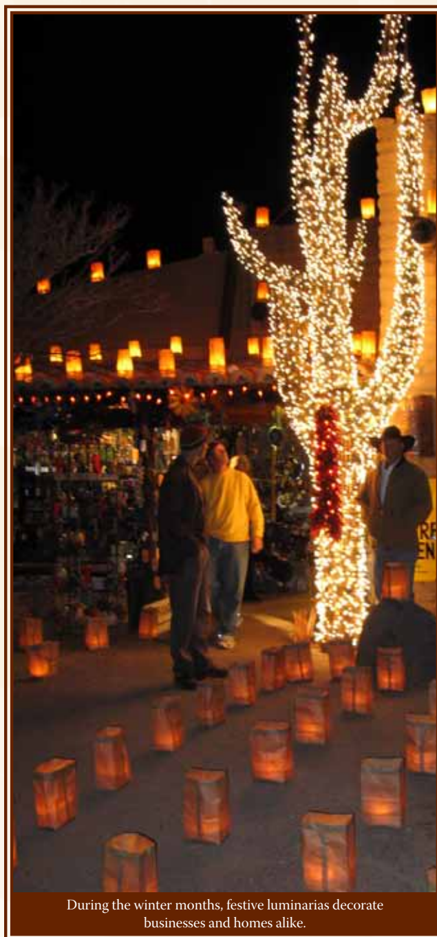
During the winter months, festive luminarias decorate businesses and homes alike.