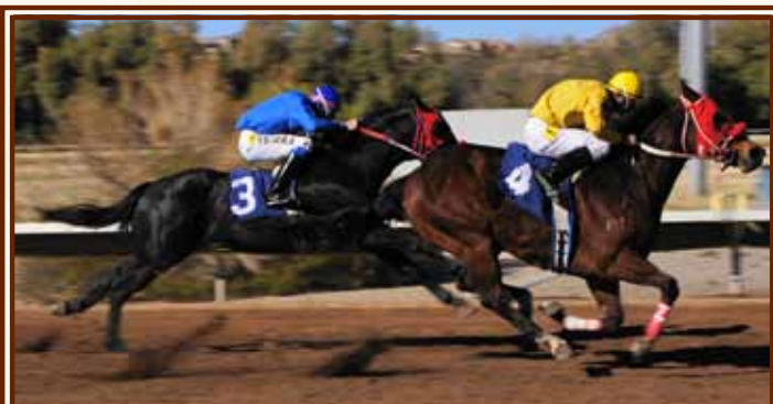
Racing started in 1943 at Rillito Downs racetrack, the birthplace of Quarter Horse racing and the photo finish. The straightaway chute is listed on the National Register of Historic Places.