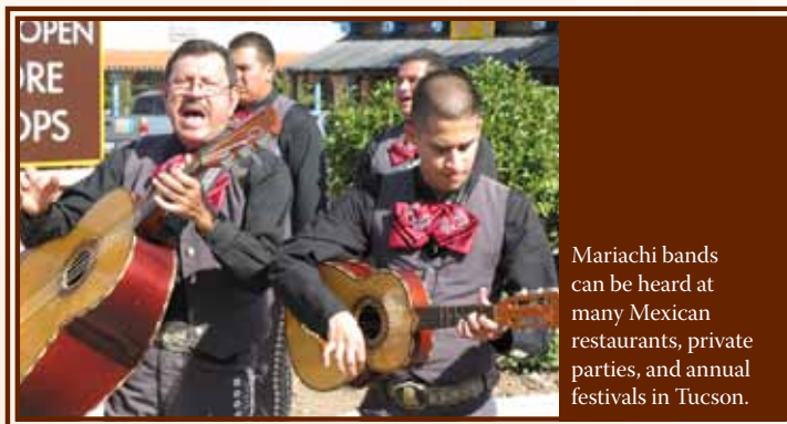
Mariachi bands can be heard at many Mexican restaurants, private parties, and annual festivals in Tucson.