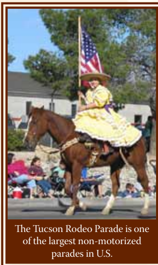
The Tucson Rodeo Parade is one of the largest non-motorized parades in U.S.