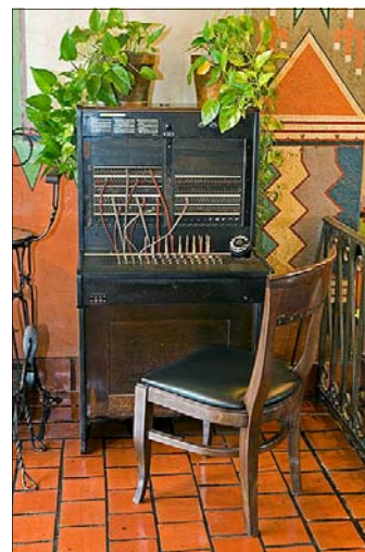
Authentic 1930's switchboard used at Hotel Congress.

This classically renovated hotel recalls the Southwestern charm of yesterday. The hotel features 40 guest rooms that transport you back to a simpler time, complete with vintage radios, antique iron beads, and a fully operational 1930's phone that actually connects to a switchboard at the front desk.