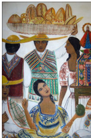
1940s mural at Hacienda Corona de Guevavi.

50% of U.S. adults participate in cultural tourism annually