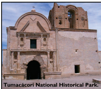
Tumacácori National Historical Park.

The term "National Heritage Area" is far too often misinterpreted to mean an area or zone where land will be regulated. In reality it is a tourism and economic development designation involving absolutely no regulatory authority to impose land use restrictions. The boundary does not impose any local, state or federal land use regulations; it simply identifies an area eligible to participate in the Heritage Area's programs and grants.