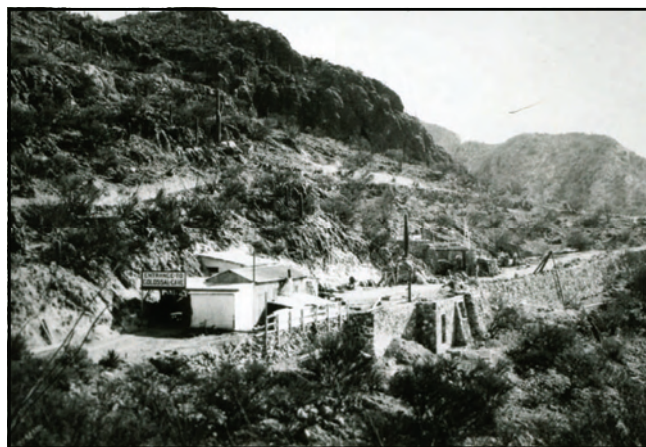
Construction of the Colossal Cave buildings by the Civilian Conservation Corps in the mid-1930s.

The net result of these efforts will be increased accessibility of existing and future oral history interviews for educational and research purposes. Please visit our website for updated information or to get involved. www.SantaCruzHeritage.org/OralHistory