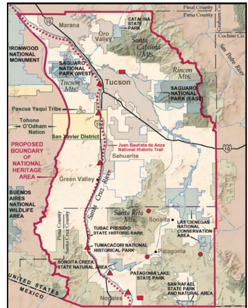
Proposed Santa Cruz Valley National Heritage Area.

We are calling on all partners and supports to contact Senator Kyl and Senator McCain immediately to urge