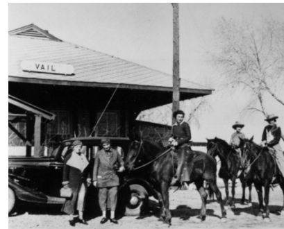
Vail Junction, 1940s